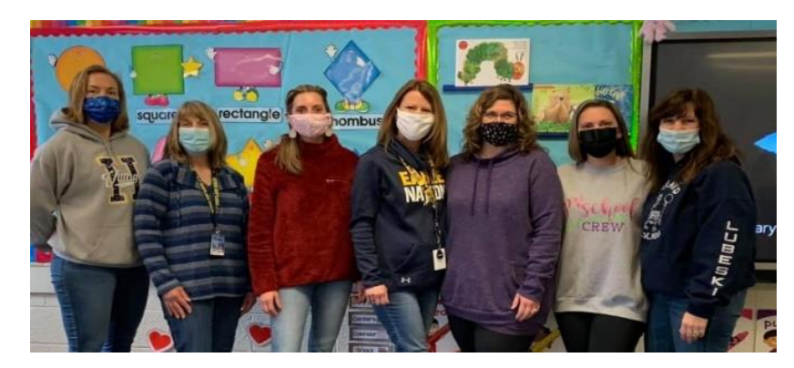
Hartland Preschool Teachers after PD on February 22

Did you know that our preschool teachers met for Professional Development on February 22nd to focus on how to continue collaborating with the district curriculum and aligning our kindergarten readiness? We worked with the district math coach on the pacing guide for Kindergarten math and the ELA coach on focusing on the Essentials 1-3.